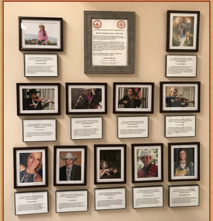
Above: The "Heritage Keeper" Scholarship Wall of Fame (includes the names and biographical information of the past recipients of the Center's Scholarships). The WHC is extremely proud of this inside display because these amazing young people will inspire a history of their own and are well worth Yavapai County's support!

End of the Year Gifting Opportunity Donate Your Tax Credit to the Western Heritage Center's Scholarship Fund!